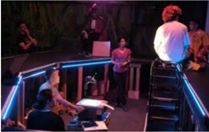
Moja experimenting with the team.