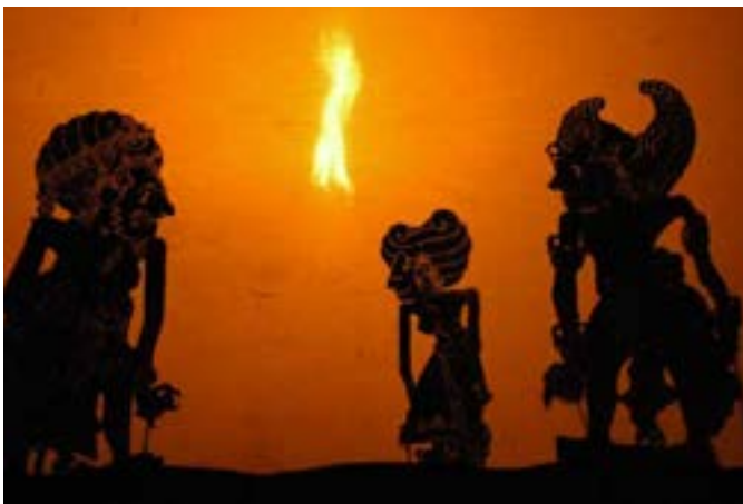
“Bali Wayang Kulit shadow puppet Ramayana”