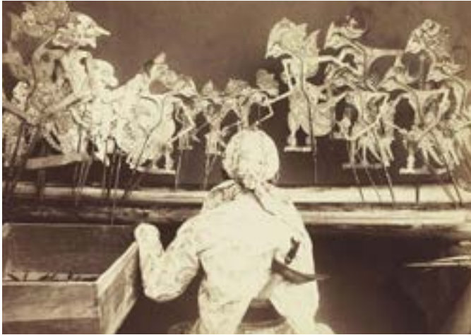
Circa 1890, Indonesia