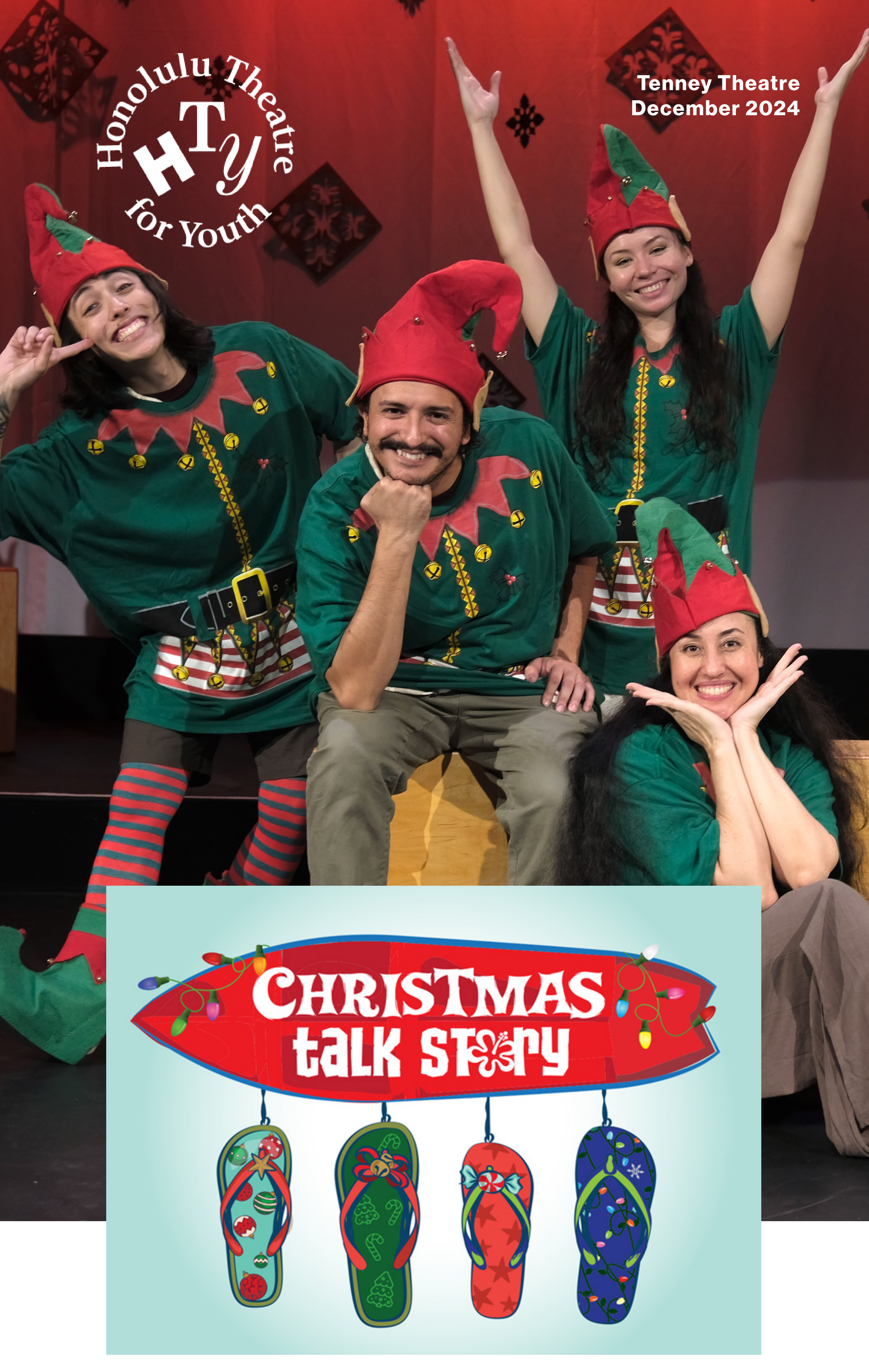
By The HTY Ensemble Inspired by Submissions from Local Students